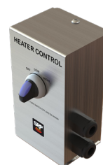
SINGLE SWITCH & TIMER