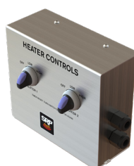
DUAL SWITCH & TIMER